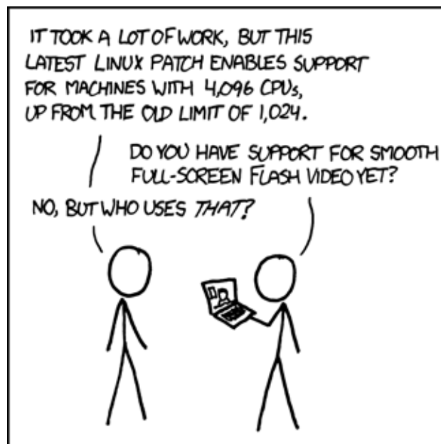
Figure 2: http://xkcd.com/619/